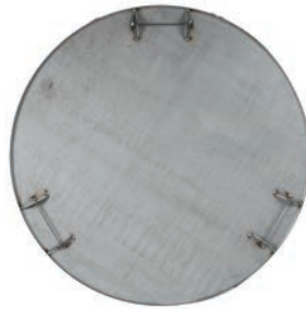
Safety Catch Pan

Scan this QR code to learn more details about this product.