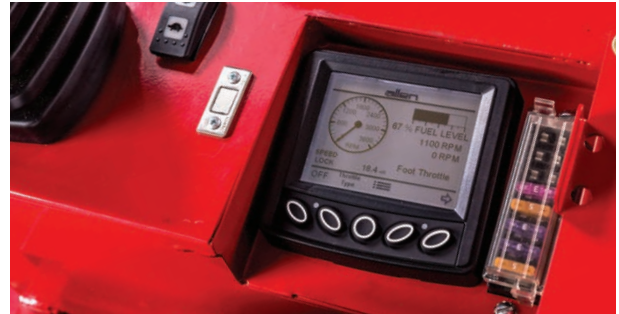
MSP475: The digital display will allow you to see rpm, temperature, hours, and more in one convenient place.