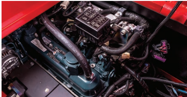
MSP475: Powerful 57 hp liquid-cooled gasoline Kubota engine provides great power for all contractor's finishing needs.