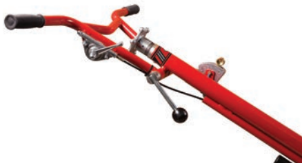
Fine pitch handles use a twist action to control blade pitch from flat to 28° and anything in between.