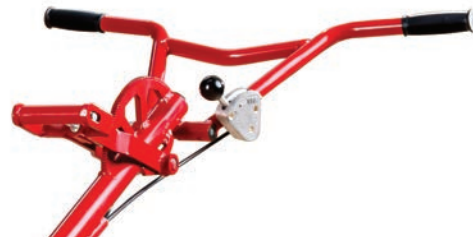
Rapid pitch handles use a ratcheting action to provide easy adjustment with the push or pull of a lever.