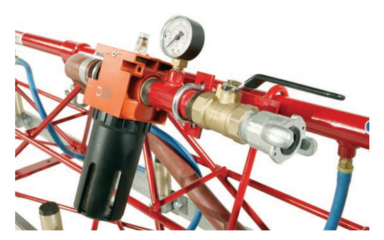
The air flow assembly controls the amount of air going to the machine, and the lubricator ensures proper piston lubrication.

For manual winches, you will need steel end handle group and the manual winch group. Hydraulic winches are available upon request.