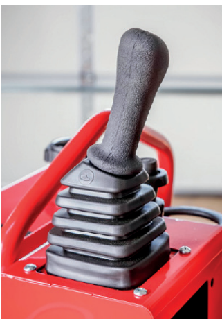
Power steering control system to increase maneuverability.

The RP245 riding polisher, with power steering, was designed with the high volume concrete polisher in mind. This riding trowel comes as designed to achieve high rotor speeds to achieve high torque while polishing. It also comes equipped with standard features power steering control and dolly jacks that ensure transportation indoors can be done with ease. This design is also built on our popular edging riding trowel frame to allow contractors to get extremely close to the wall while polishing.