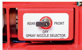
Rear and front spray nozzle selector.