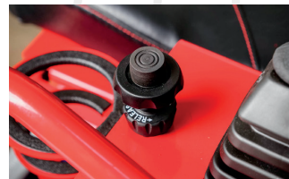
Cruise Control to maintain consistent rotor speed.