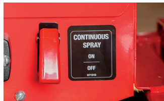
Continuous spray option for consistent application.