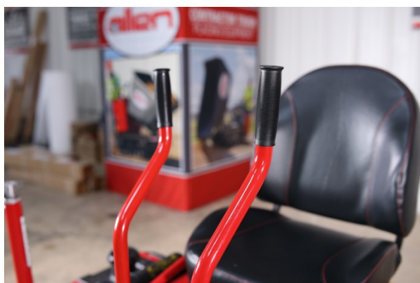
Manual dual level steering