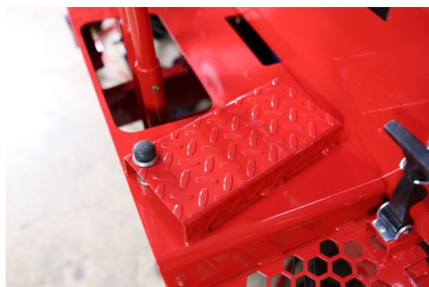
Push to spray foot pedal