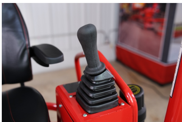
Hydraulic joystick power steering on the MP245