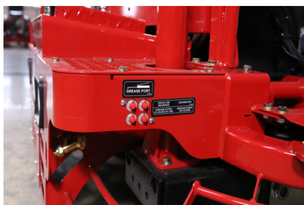
Central grease ports