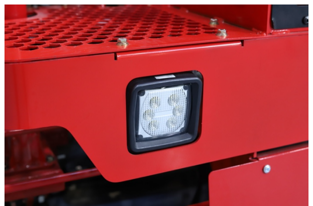
Adjustable LED lights