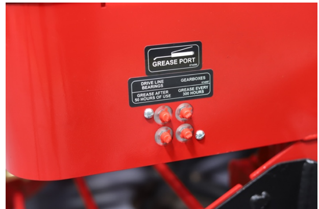
Central grease ports