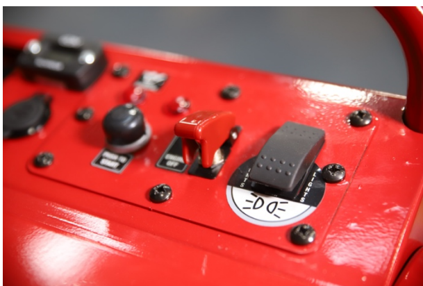
Light switch, toggle power switch, and push to start button on the MSP445