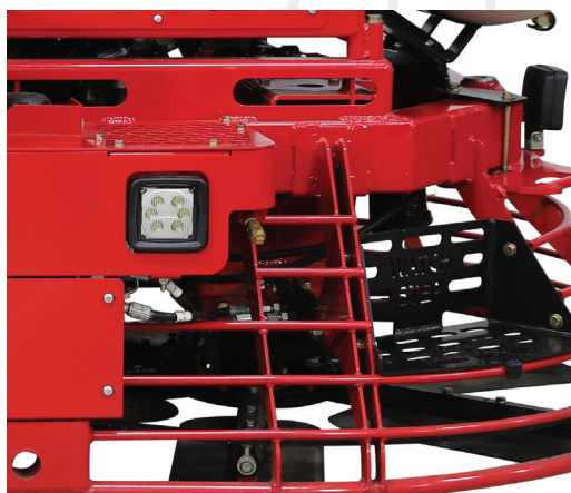
Super-duty cast iron spiders with six super-duty steel trowel arms