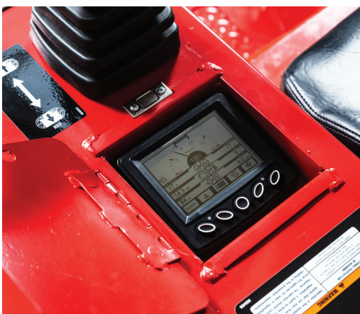
Digital read out shows accurate fuel levels, temperatures and more.

Scan this QR code to learn more details about this product.